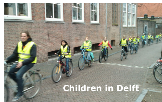
Children in Delft

The first stakeholder workshop took place in The Hague on Nov. 16 2010 in the framework of the third AA project meeting and the Walk21 Conference. Each application partner brought one stakeholder to the exchange event, including politicians and technicians. Participants of the Walk21 Conference were also invited to participate in the event as a pre-workshop of the conference. Among the topics were “Investing to encourage walking” and “Walking for Health”.