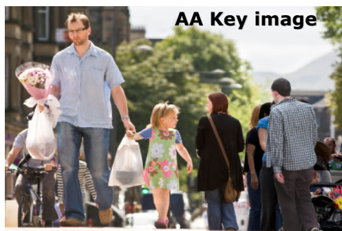
AA Key image

Two main activities have been carried out by FGM-AMOR for the WP 7 – Communication and dissemination: